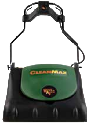
Wide Area Vacuum