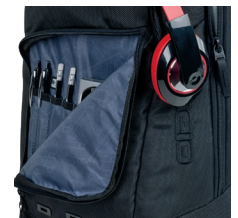
DELUXE ORGANIZATION PANEL