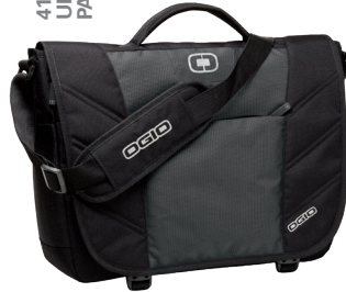
417015 UPTON PAGE 31