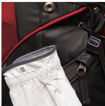
HOOK AND LOOP GLOVE PATCH

Due to the size and/or weight of this product, it may require additional freight charges. Ask your representative for more information.