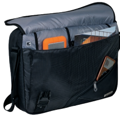
THREE COMPUTER ACCESSORY SLEEVE POCKETS