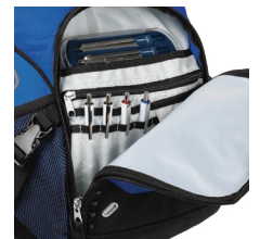
DELUXE ORGANIZATION PANEL