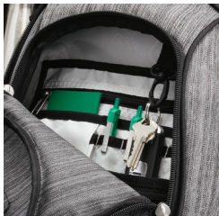
DELUXE ORGANIZATION PANEL