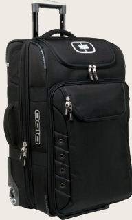
CANBERRA 26 413006-26"h