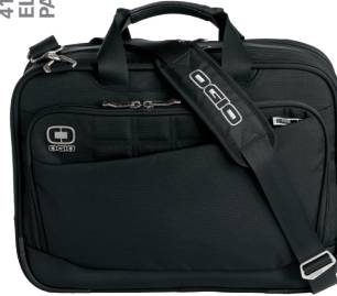
417003 ELEMENT PAGE 30