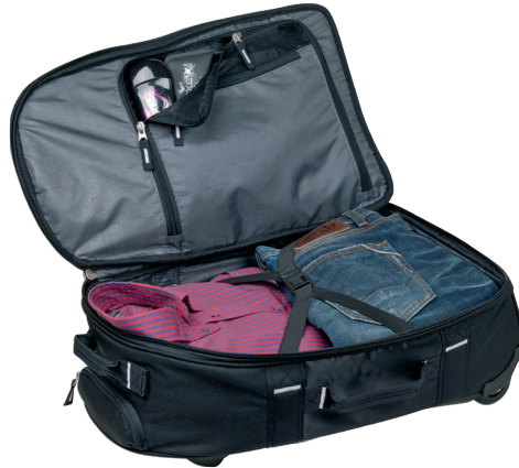
LARGE CENTER STORAGE AREA

Due to the size and/or weight of this product, it may require additional freight charges. Ask your representative for more information.