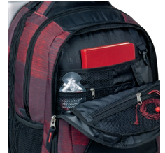
DELUXE ORGANIZATION PANEL