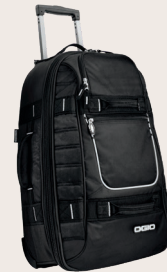
PULL-THROUGH 611024-22"h CARRY-ON SIZE