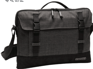
417051 APEX 15 SLIM CASE PAGE 32