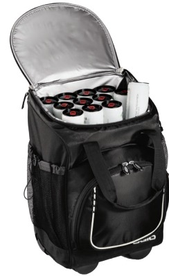
PEVA COOLER LINER