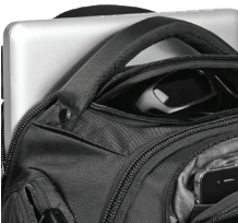
REAR PADDED LAPTOP COMPARTMENT AND TECH VAULT