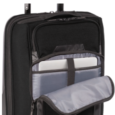
EASY-ACCESS LAPTOP COMPARTMENT (NOMAD 22 ONLY)