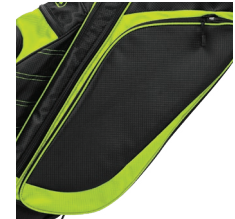
DETACHABLE POCKET FOR EASY DECORATION