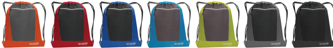
HOT ORANGE/ GREY