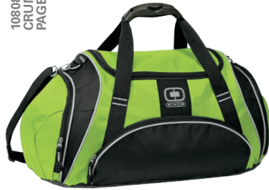
108085 CRUNCH PAGE 37