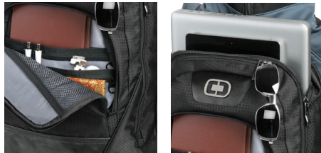
DELUXE ORGANIZATION PANEL