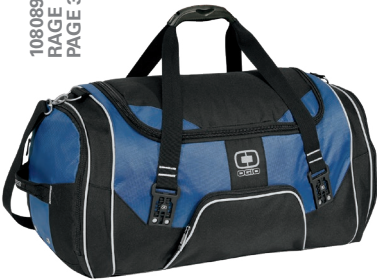
108089 RAGE PAGE 39