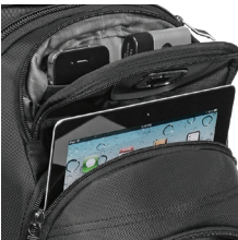
PADDED TABLET/E-READER SLEEVE