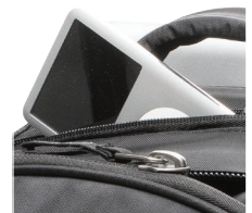
FLEECE-LINED VALUABLES POCKET