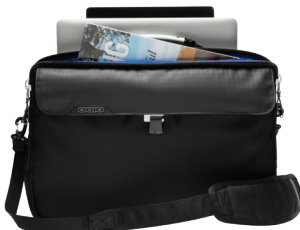
EASY-ACCESS PADDED LAPTOP COMPARTMENT