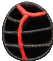
8-WAY WOODE™ TOP

8-way Woode™ top • Triple Triangle suspension shoulder strap system • 6 zippered pockets • fleece-lined valuables pocket • walking-accessible water bottle holster • hook and loop glove patch • padded back for ventilation • rain hood • large detachable side pocket and ball pocket for easy decoration