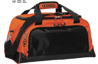
411095 BREAKAWAY PAGE 41