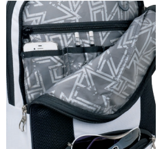
DELUXE ORGANIZATION PANEL