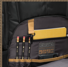
DELUXE ORGANIZATION PANEL