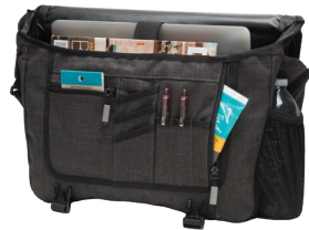
DELUXE ORGANIZATION PANEL