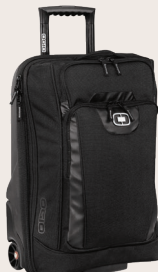
NOMAD 22 413018-22"h CARRY-ON SIZE