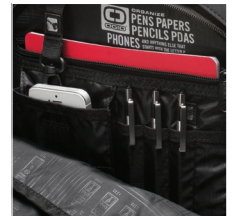
DELUXE ORGANIZATION PANEL