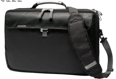
417053 PURSUIT MESSENGER PAGE 30