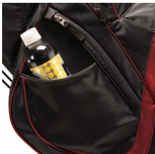
WATER BOTTLE HOLSTER

VALUABLES POCKET SHOE POCKET HYDRATION POCKET GOLF GLOVE UMBRELLA HOLDER