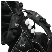
SHOXX™ SHOULDER PADS & OGIO BALL SILO™

Due to the size and/or weight of this product, it may require additional freight charges. Ask your representative for more information.