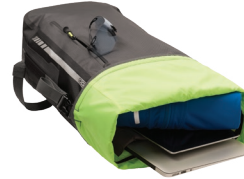
WATERPROOF MAIN COMPARTMENT WITH ROLL-TOP