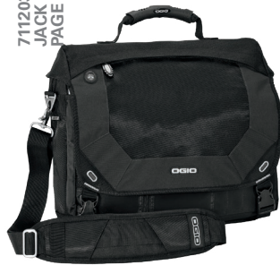
711203 JACK PACK PAGE 31