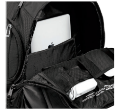
DUAL MESH AND DUAL FLEECE-LINED POCKETS