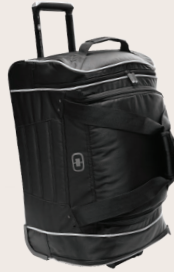
HAMBLIN 22 413009-22"h CARRY-ON SIZE