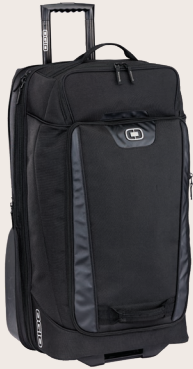
NOMAD 30 413017-30"h