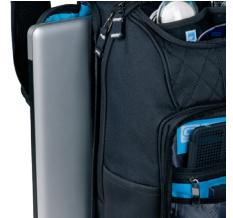
SIDE-ENTRY PADDED LAPTOP PROTECTION SYSTEM