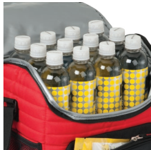
INSULATED MAIN COMPARTMENT