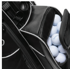
ZBP™ (ZIPPERLESS BALL POCKET)

CELL POCKET VALUABLES POCKET SHOE POCKET HYDRATION POCKET GOLF GLOVE PENCIL STALL UMBRELLA HOLDER