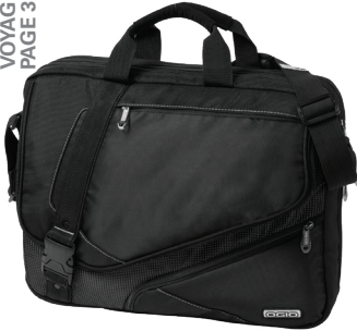
117023 VOYAGER PAGE 31