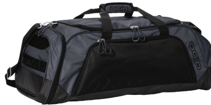
411097 TRANSITION PAGE 41