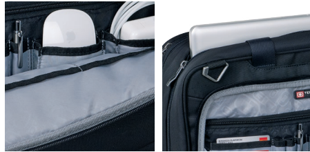
PADDED POCKETS FOR SMALL ELECTRONICS