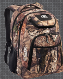
MOSSY OAK® BREAK-UP® COUNTRY (411069C ONLY)