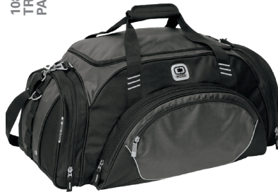
108084 TRANSFER PAGE 39