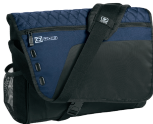
417012 VAULT PAGE 32