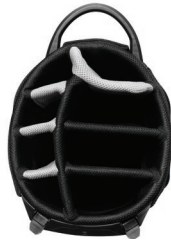
9.5" WOODE™ TOP

9.5" Woode™ top with integrated grab handle and oversized putter pit • ZBP™ (Zipperless Ball Pocket) • low-profile OGIO Ball Silo™ (ball dispenser) • cart strap channel • 6 zippered pockets • weather-resistant fleece-lined valuables pocket with cellphone sleeve • walking-accessible insulated water bottle holster • scorecard/range finder/GPS sleeve • pen sleeve • divot tool sleeve • tee holder • large detachable side pocket for easy decoration