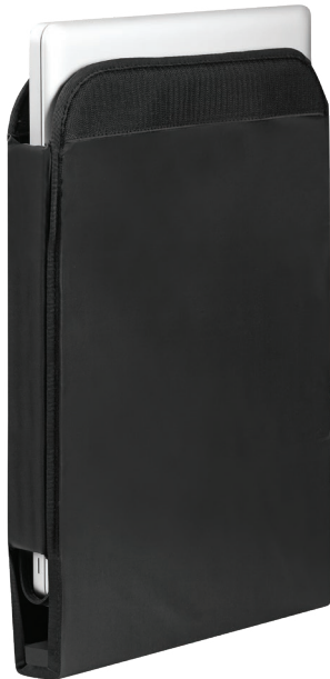
BUILT-IN REACTIVE SUSPENSION SYSTEM (RSS)