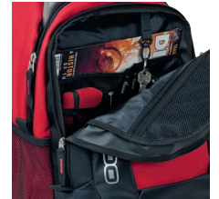
DELUXE ORGANIZATION PANEL