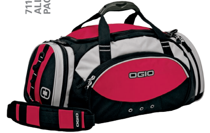
711003 ALL TERRAIN PAGE 38