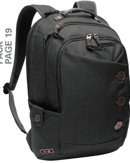
414004 LADIES MELROSE PACK PAGE 19