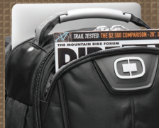
TOP-ENTRY LAPTOP SLEEVE