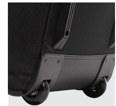
SMOOTH-ROLLING URETHANE WHEELS