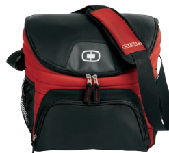
408113 CHILL 18-24 PAGE 43