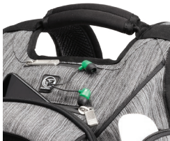
NEOPRENE TOP GRAB HANDLE AND HEADPHONE EXIT PORT