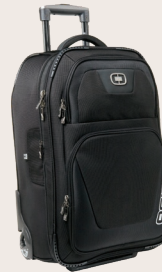
KICKSTART 22 413007-22"h CARRY-ON SIZE