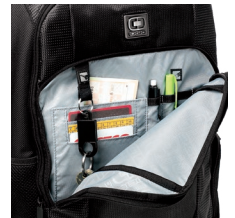
DELUXE ORGANIZATION PANEL