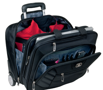
TWO LARGE COMPARTMENTS