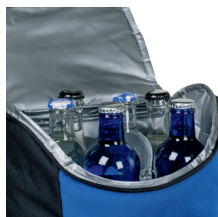
INSULATED MAIN COMPARTMENT