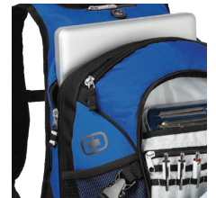
BACK COMPARTMENT PADDED LAPTOP SLEEVE