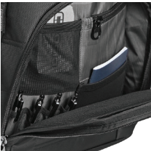
ZIPPED POCKETS FOR GADGETS