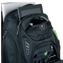
LAPTOP POCKET AND TABLET/E-READER SLEEVE