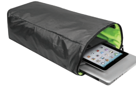
REMOVABLE LAPTOP/TABLET ORGANIZATION SLEEVE