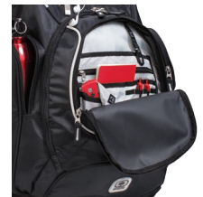
DELUXE ORGANIZATION PANEL