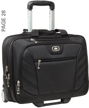
417018 LUCIN PAGE 28