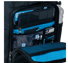
DELUXE ORGANIZATION PANEL