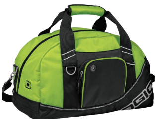
711007 HALF DOME PAGE 42