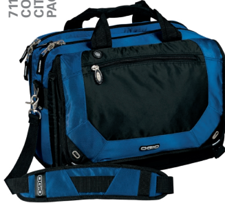
711207 CORPORATE CITY CORP PAGE 29