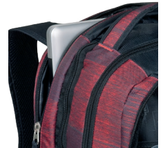
TOP-ENTRY PADDED LAPTOP COMPARTMENT