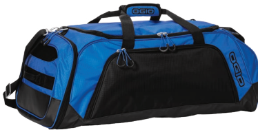
ELECTRIC BLUE/ BLACK