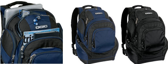
LARGE STORAGE AREA FOR BELONGINGS